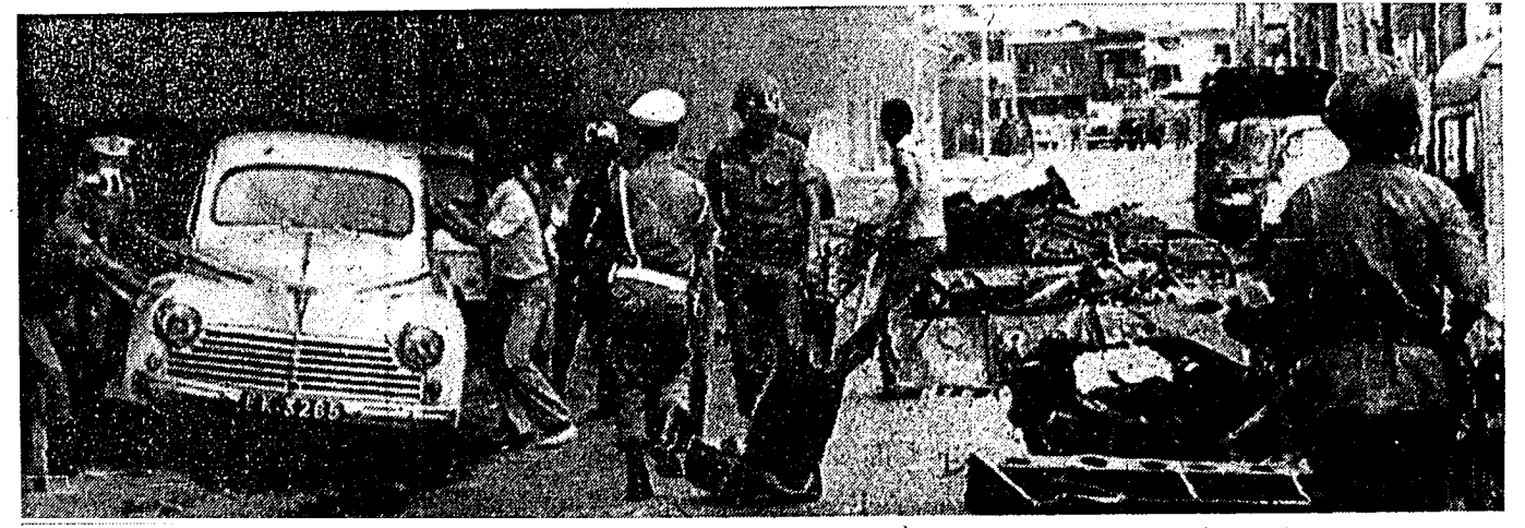
After one of the final rocket attacks on Saigon, South Vietnamese police attempt to clear wreckage from a main street.